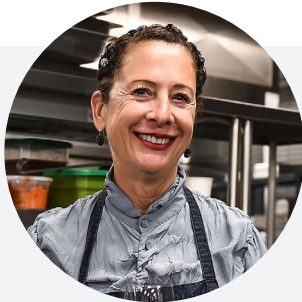
Chef Nancy Silverton